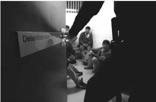
12. Asylum-seekers who arrived in the UK aboard a freight train being detained in a holding cell in Folkestone

The situation of rejected asylum-seekers remaining in the destination country despite having had their applications and